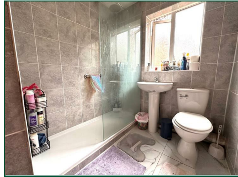
1ST FLOOR 315 sq.ft. (29.3 sq.m.) approx.